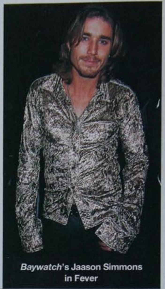
Baywatch's Jason Simmons in Fever

They don't lie quietly, waiting for you to shimmy up to them. Rather, they insidiously beckon, Look-a-here, my dear, have I got something to show you. And ever since Eve gave in to slithery charm, women have been tempted