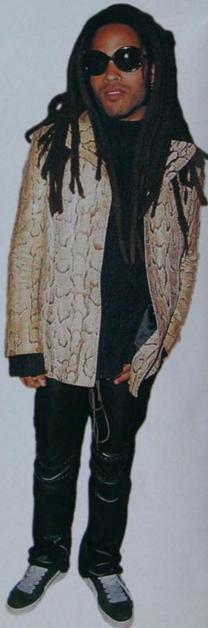
Rock musician Lenny Kravitz

by snakeskin's slinky, pliant sheen. Winding its way in and out of fashion as quickly as a cobra strikes, the question remains, Is the serpentine pattern chic? Or is it tacky? Wanna bite?