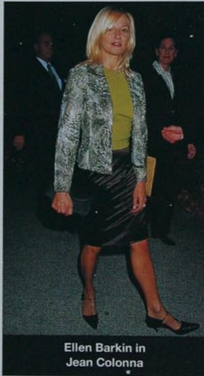
Ellen Barkin in Jean Colonna

by snakeskin's slinky, pliant sheen. Winding its way in and out of fashion as quickly as a cobra strikes, the question remains, Is the serpentine pattern chic? Or is it tacky? Wanna bite?